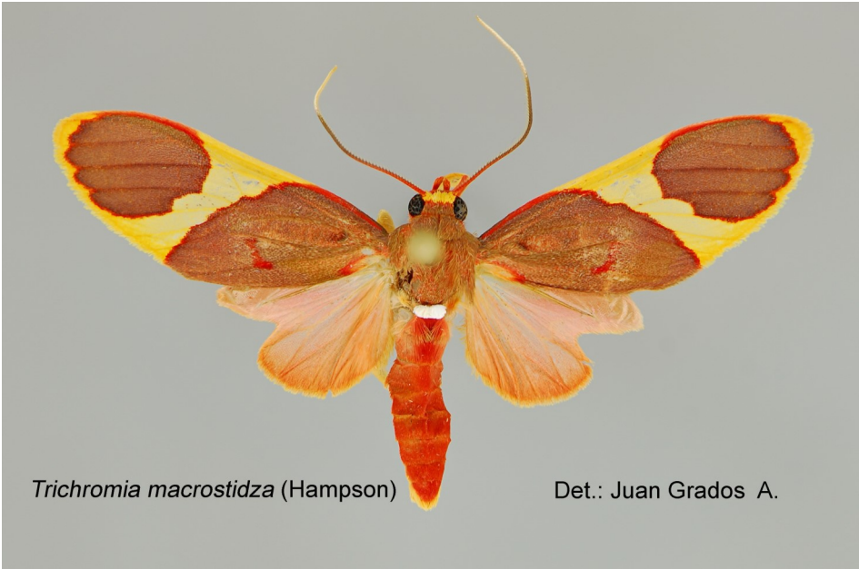
Trichromia macrostidza (Hampson)

If you have any customers that you think will be interested in this unique experience, offered them the Wired Amazon Program .