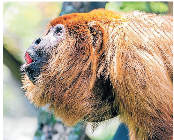
In the wild: (Clockwise from main) a jaguar; indigenous canoe; Refugio Amazonas; a red howler monkey.

descended, the forest was almost completely dark, though fire-flies lit our way home.